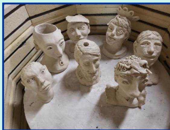
POTTERY CLASS Fantastic ...

We had 45 potters assisting with various aspects of the event, including making planters, preparing Raku pots, and handling the festival set-up and take-down. All JIAA members are now looking forward to our upcoming expansion and move.