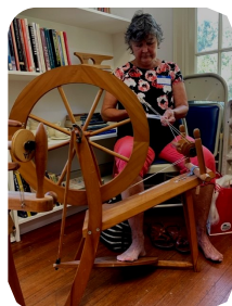
Spinning Class Students