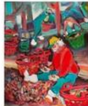
Sue Byrne Russell