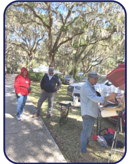
Here are a couple of artists pictured during the festival.

Thank You Everyone for Making the 2023 Arts Festival an Amazing Success!