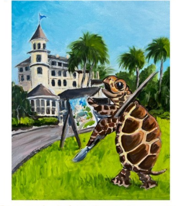
Sponsored by the Jekyll Island Arts Association Friday. March 10, 12-5 pm Saturday. March 11, 10-5 pm Sunday. March 12, 10-4 pm